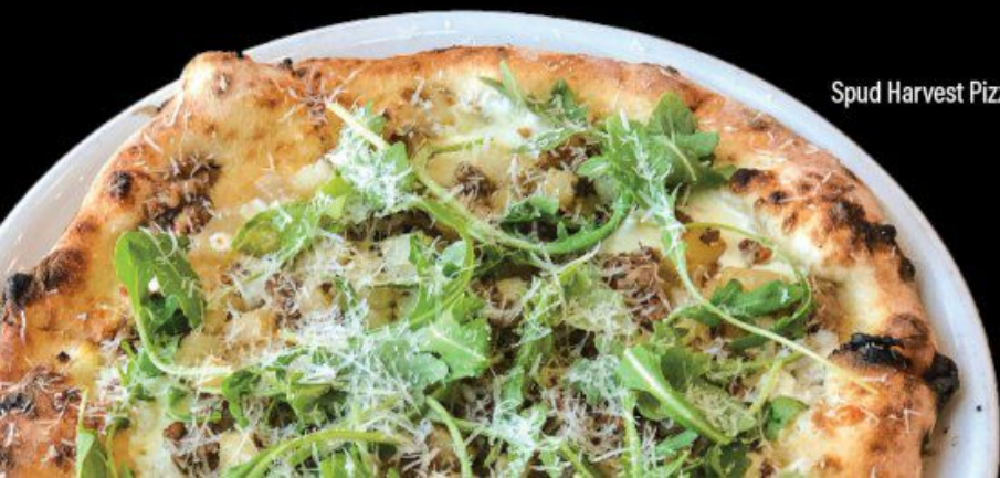
Spud Harvest Pizza

Mushroom, potato, red peppers, fire roasted red onion, fresh sliced tomatoes, arugula, San Marzano tomato sauce, oregano