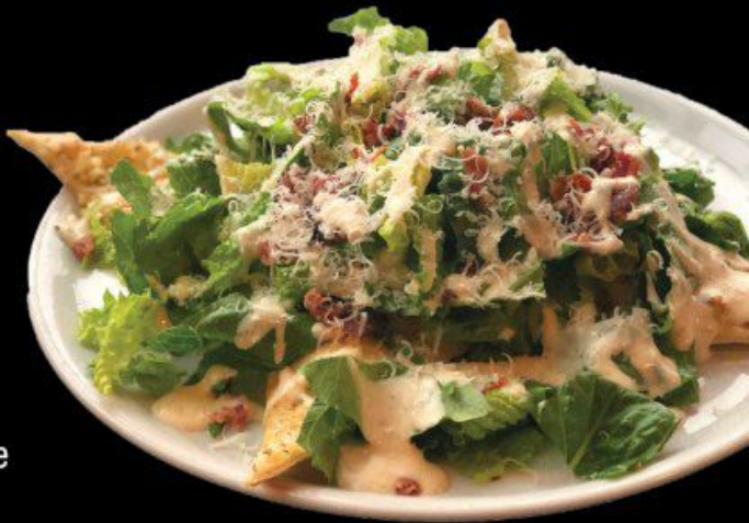
Hail Caesar Salad

Fresh mozzarella, fresh cut garlic, olive oil and oregano, with Marinara dipping sauce